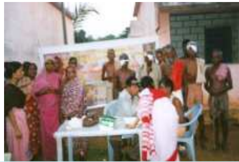
BASAIID supported free screening camps and cataract surgery for 97 leprosy affected persons in Jajpur, Anugul and Dhenkanal