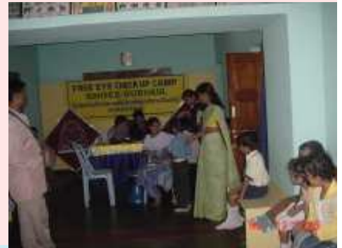
Glimses from the School Children's Eye Screening camp organised at various schools in Dhenkanal District, Orissa.