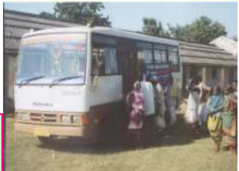
The mini-bus, provided by ORBIS International in an Outreach Camp