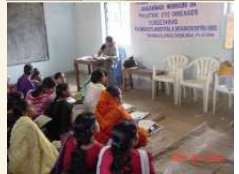
Anganwari Workers' Training on Paediatric Eye Care

was held at the hospital premises and 17 practicing Ophthalmologists participated in it.